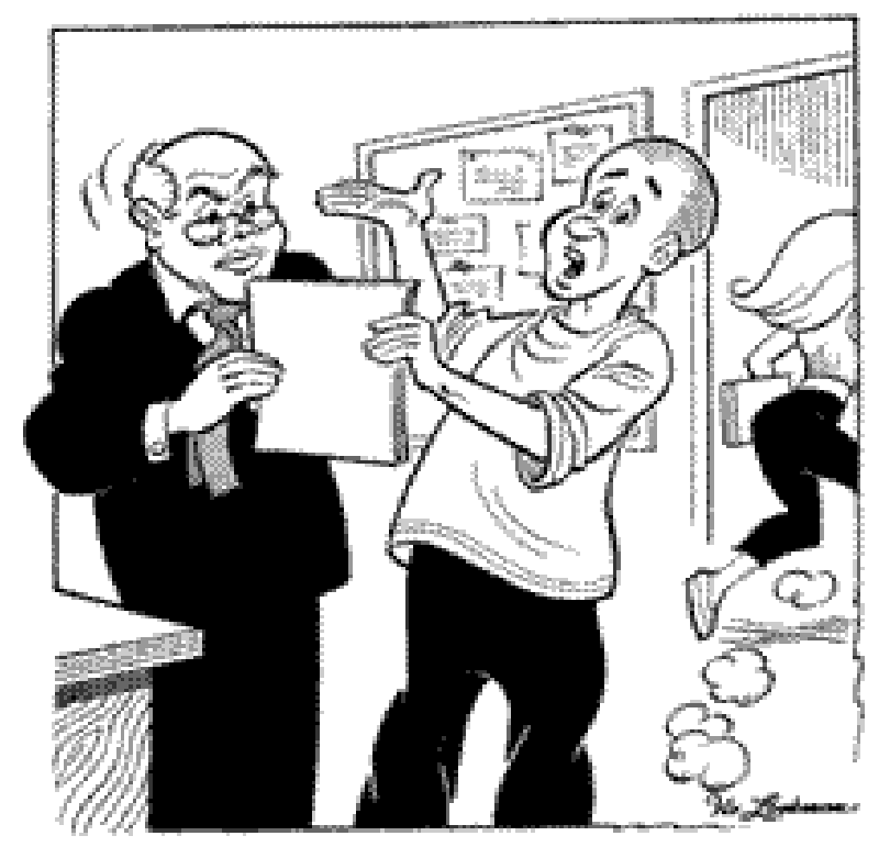
"Plagianism ?" But my roommate gave me permission to use his paper and said I didn't have to cite him."

"Ghost Writer"—Turn in someone else's work, word-for word, as your own.